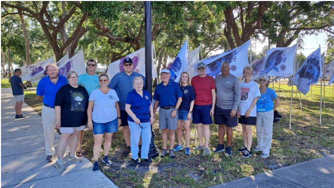
Our Local Club Members who helped setting up Memory Field Flags

The Children's Memory Field flags were on display at Riverview Park from April 1 st through April 15 th . These flags represent the children who have died in Florida from child abuse during this past year. Sadly, 96 flags have been erected bearing the names of these children. Our club participated in a collaborative effort to set these flags up on April 1 st . The flags were removed and reset at a Vero Beach location on April 15 th .